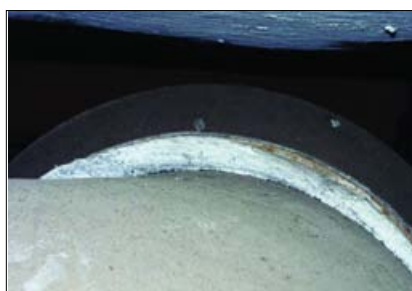
Joint packing on a flue