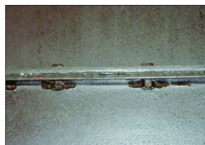
String gasket between metal sheets