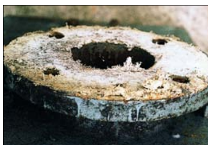
Gasket material left on a pipe flange